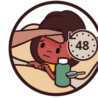
Has fever or pain after taking an antibiotic for 48 hours