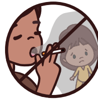
Keep away from second-hand smoke