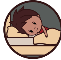
Not sleeping well