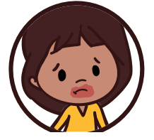
Gets a rash or swollen face when taking the antibiotic