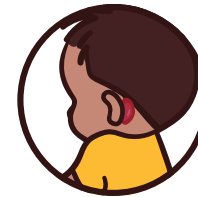
Has redness or swelling behind the ear