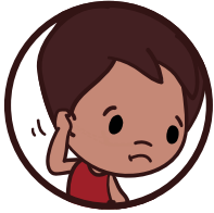
Pulling or rubbing the ear