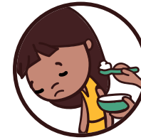
Is not eating or drinking or is throwing up