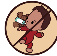
Avoid propping up your child's bottle