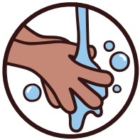
Wash hands and your child's toys