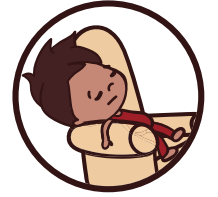
Seems very sleepy or cranky