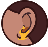
Fluid draining from the ear