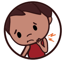
Has a painful or stiff neck