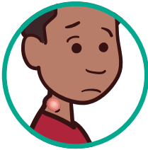
Enlarged lymph nodes