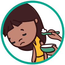
Weight loss Poor weight gain