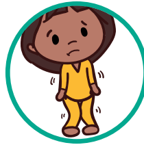
Back pain Weakness in arms or legs