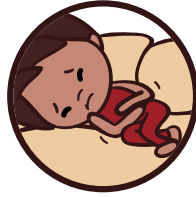
Stomach pain or cramps