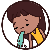
Vomiting (throwing up)